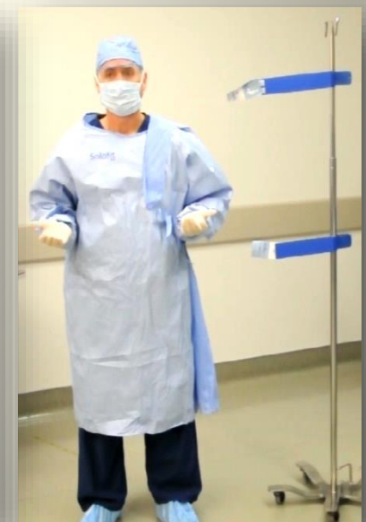
Adjust shoulder strap and waist ties for customized, comfort fit.

For more information Visit: www.orinnovations.com