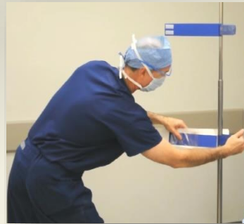
Attach Non-sterile clips to IV pole and position Sterile Tabs