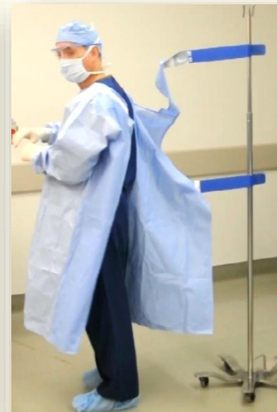
With tabs secured, rotate into the gown, while adjusting gown to shoulders