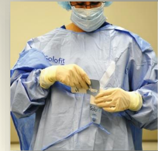
Grasp and separate connected Tabs from SoloFit front