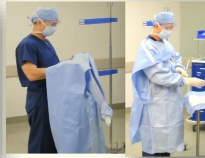
Using single person aseptic technique, don gown and gloves.